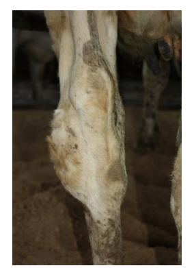
Swellings ≥ 5 cm in diameter